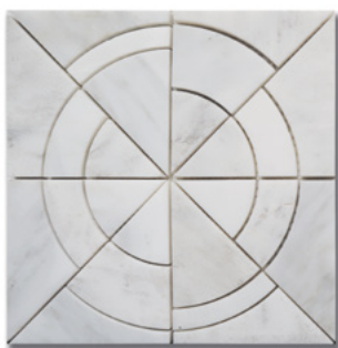
Architetto Compasso Carrara Bella (H&SB) MB1604-COMP00