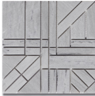
Architetto Angolo Ash Gray (H)