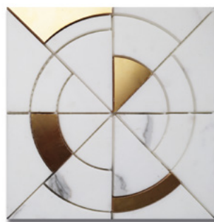
Architetto Compasso Calacatta (H) w/ Brass MB1203-COMPH0