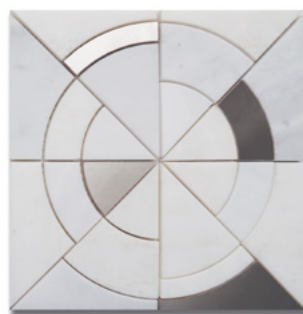
Architetto Compasso Carrara Bella (H) w/ Stainless Steel MB1604-COMPH0