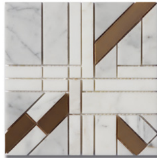
Architetto Angolo Calacatta (H) w/ Brass