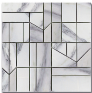
Architetto Modulo Carrara Bella (H&P)