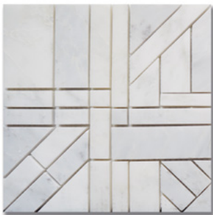
Architetto Angolo Carrara Bella (H)