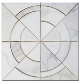
Architetto Compasso Calacatta (H&SB) MB1203-COMP00