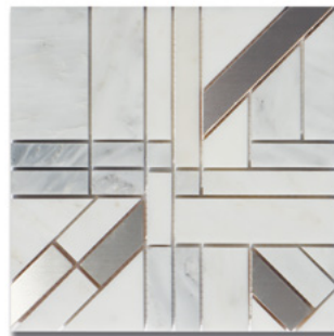
Architetto Angolo Carrara Bella (H)