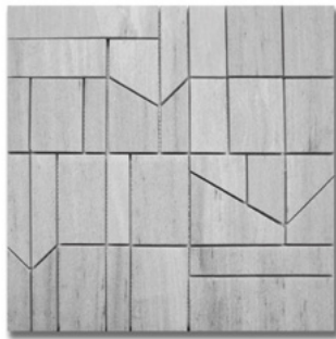
Architetto Modulo Ash Gray (H&P)