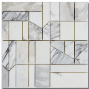
Architetto Modulo Calacatta (H&P)