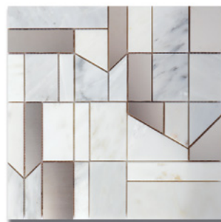
Architetto Modulo Carrara Bella (H)