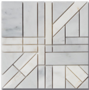
Architetto Angolo Calacatta (H)