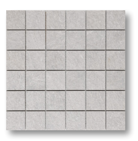
Primal 2" x 2" Warm (Textured) PO2855-M002T0