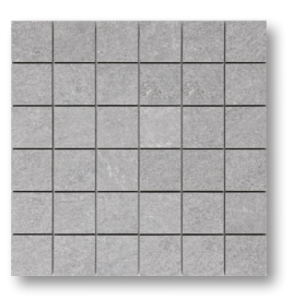
Primal 2" x 2" Silver (Textured) PO2854-M002T0