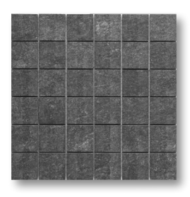
Primal 2" x 2" Coal (Textured) PO2852-M002T0