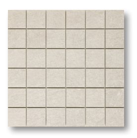
Primal 2" x 2" Sand (Textured) PO2853-M002T0