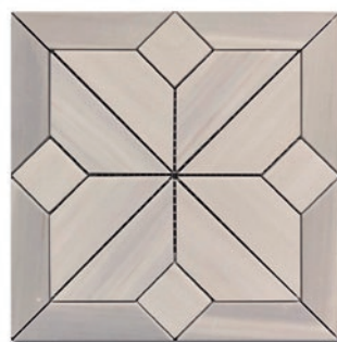
Wish Imagine Windstorm (H/P) MB2345-IMAGH0