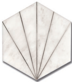
Wish Desire Carrara Bella (H) w/ Stainless Steel MB1604-DESRHO