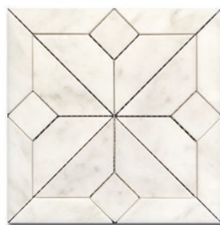
Wish Imagine Carrara Bella (H/P) MB1604-IMAGH0