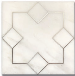
Wish Hope Carrara Bella (H) w/ Stainless Steel MB1604-HOPEHO