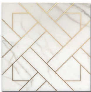
Wish Covet Calacatta (H) w/ Brass MB1203-COVTH0