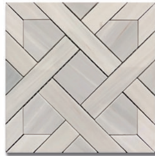
Wish Crave Windstorm (H/P) MB2345-CRAVHO