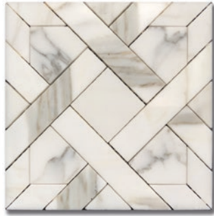
Wish Crave Calacatta (H/P) MB1203-CRAVHO