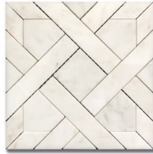
Wish Crave Carrara Bella (H/P) MB1604-CRAVHO