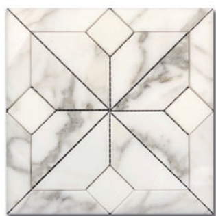
Wish Imagine Calacatta (H/P) MB1203-IMAGH0