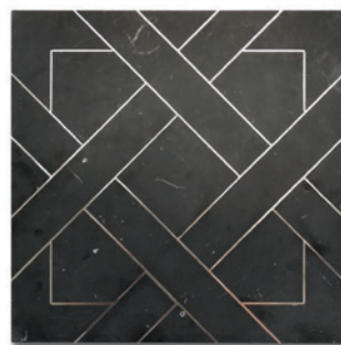
Wish Covet Tulip Black (H) w/ Stainless Steel MB1187-COVTH0