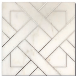
Wish Covet Carrara Bella (H) w/ Stainless Steel MB1604-COVTH0