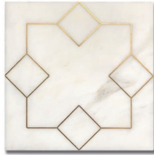
Wish Hope Calacatta (H) w/ Brass MB1203-HOPEHO