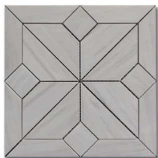
Wish Imagine Torrent (H/P) MB2346-IMAGH0