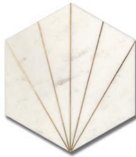
Wish Desire Calacatta (H) w/ Brass MB1203-DESRHO