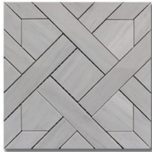
Wish Crave Torrent (H/P) MB2346-CRAVHO